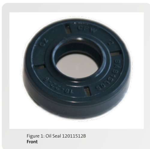
Figure 1: Oil Seal 12011512B Front

The OEM, Freudenberg Sealing Technologies, has implemented a size reduction for the oil seal 12011512B. The height of 7mm was reduced to 6mm. This size reduction does not compromise the functionality of the seal.