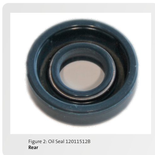
Figure 2: Oil Seal 12011512B Rear