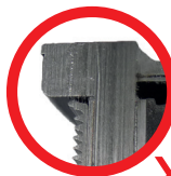
No visco fluid