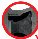
No heat shield