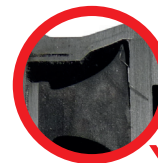
No rubber-to-metal bonding