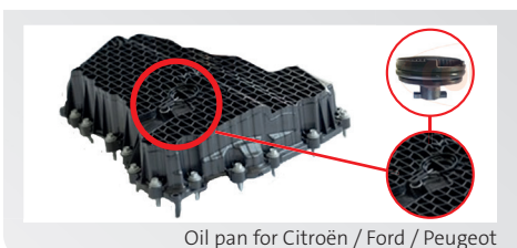
Oil pan for Citroën / Ford / Peugeot