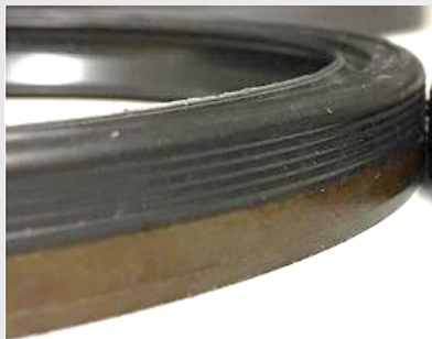
Figure 1: old version