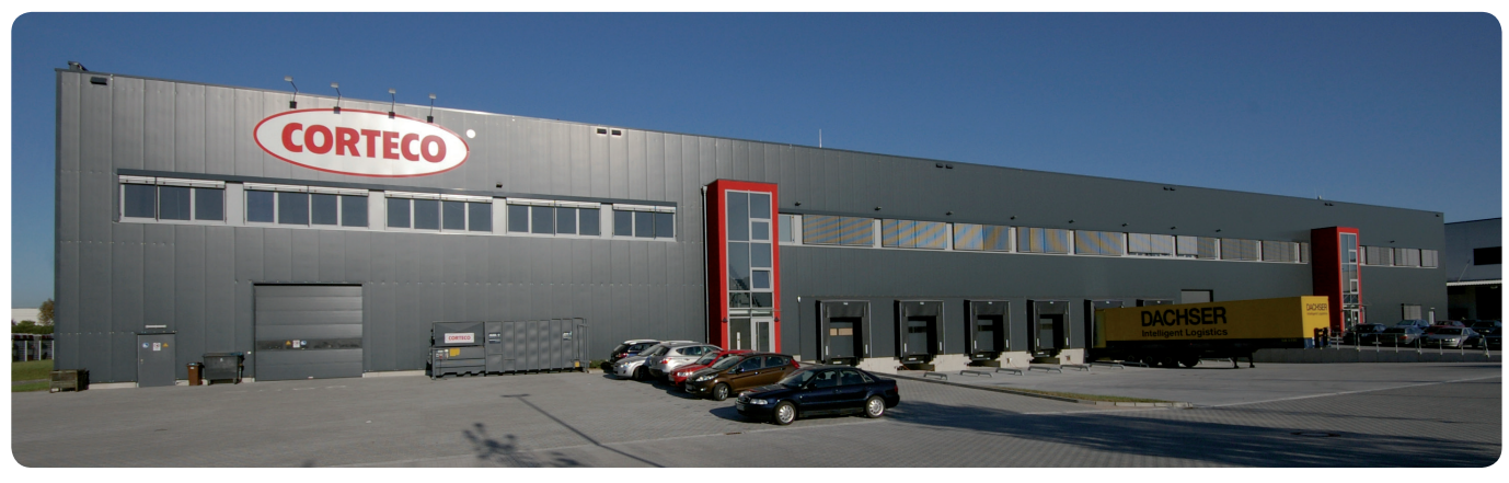
European central distribution center located in Hirschberg, Germany.