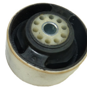
Figure 2: Engine Mount 49374235, size 67mm