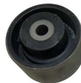
Figure 3: Engine Mount 80000103, size 65mm