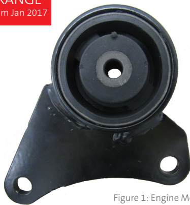
Figure 1: Engine Mount 49377176 including metal fixture