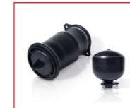
Airsprings and Suspension Spheres