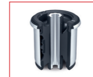
Chassis and Drive Train Mounts