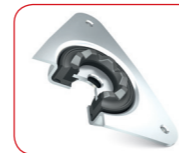
Suspension Strut Mounts