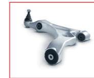
Track Control Arms