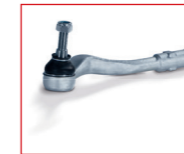
Tie Rod Ends and Tie Rods