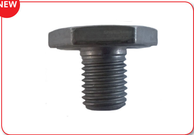
Figure 1: Updated design and material for 220116S and 220054H