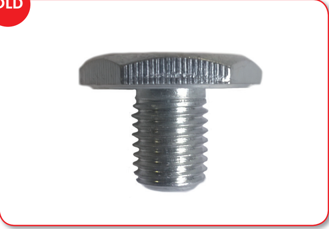
Figure 2: Old design and material for 220116S and 220054H