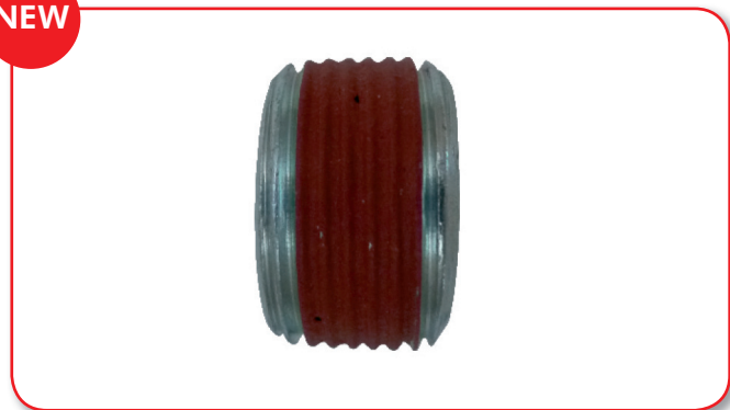
Figure 2: New improved Oil Drain Plug 220127S, 220127H